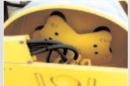
Efficient direct drum drive

With these features and many more, it's easy to see why these models maintain a high residual value while delivering lower lifetime operating costs.