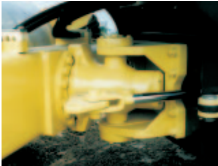
Bolt-on oscillating, articulation joint for long life and servicing ease

High compaction performance ensures greater productivity and better profits