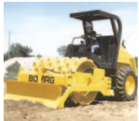
The BW177PDH-3 provides enhanced gradeability on cohesive soil applications