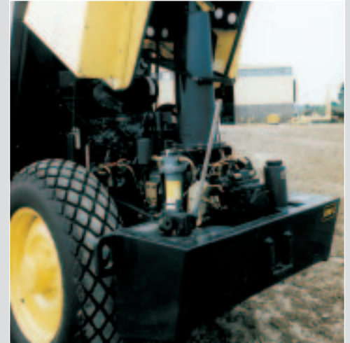
Wide opening hood provides easy access to all components