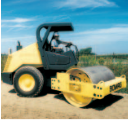
BW177DH-3 – proven compaction performance for medium-sized projects

High compaction performance ensures greater productivity and better profits