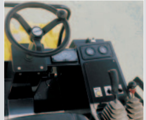
Excellent all-round visibility and ergonomic control layout