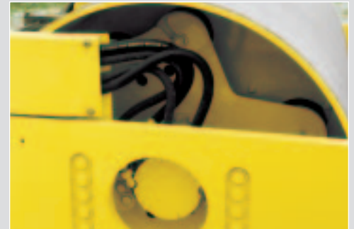
Efficient direct drum drive