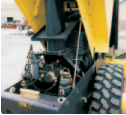
Wide opening hood provides easy access to all components