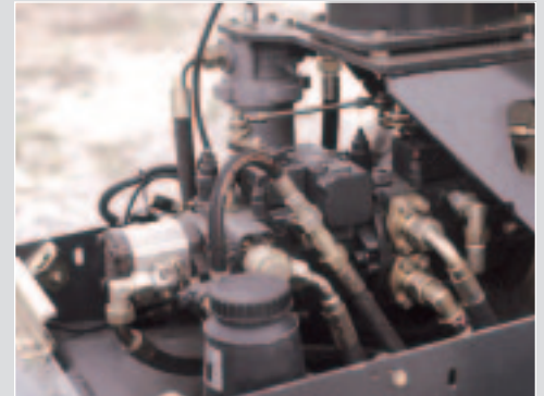
Dual travel pump design of the DH / PDH-3 models further enhances tractive effort and gradeability.

With these features and many more, it's easy to see why this model maintains a high residual value while delivering lower lifetime operating costs.