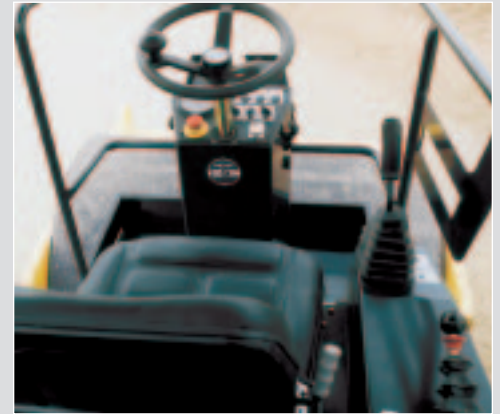
Excellent all-round visibility and ergonomic control layout

High compaction performance means greater productivity and better profits