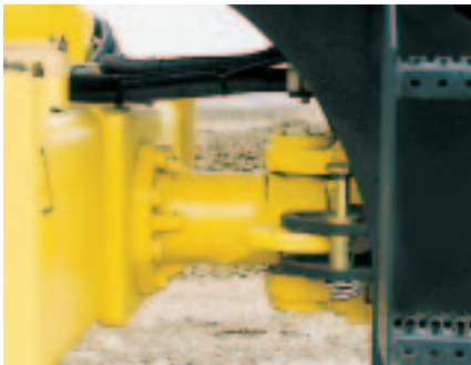
Bolt-on oscillating, articulation joint for long life and servicing ease

High compaction performance means greater productivity and better profits