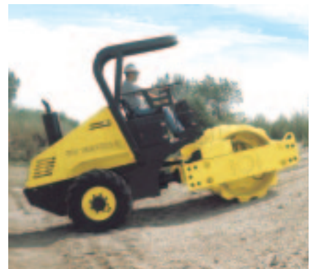
BW145PDH-3 Padfoot model for cohesive material. Also available with optional leveling blade.